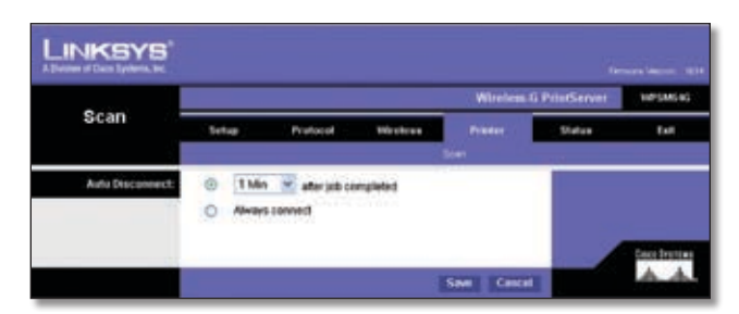
Printer > Scan - Auto Disconnect

1 min after job completed To change the number of minutes before the computer is disconnected from the printer, enter the new number (1-60) in this field.